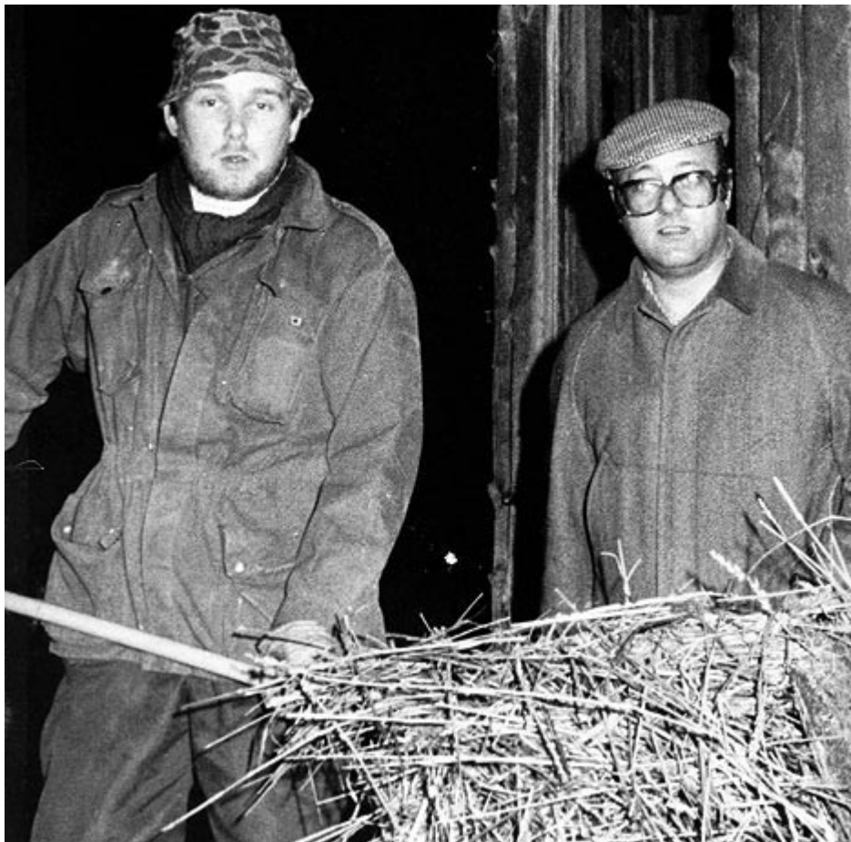
It's the guy on the left what did it. Honest.