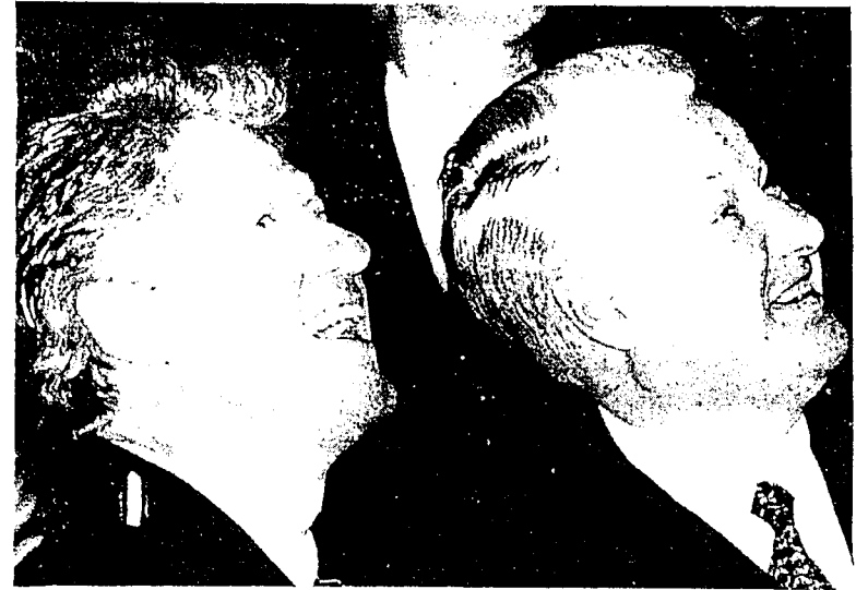
SERVING THE SAME MASTERS? Clinton and Yeltsin in Moscow last month.

The rise of Slavic nationalism and the appearance of Vladimir Zhirinovskiy on the Russian stage have the New World Order globalists in a tizzy. And so they might. Boris Yeltsin is a boozy dictator who has the support of the Oberjuden who operate the World Bank and the International Monetary Fund. Yeltsin is their puppet.