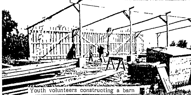
Youth volunteers constructing a barn

In December I made my eighth travel to East Prussia. It was highly necessary for our friends there were very uneasy because some journalists from Germany had placed a dirty article about me in the Russian newspaper, trying to discredit our work and preventing us from going there. But the Russian administration was as kind as ever. And our construction project is making good progress. The first house in Wildshelde is taking shape. And soon we want to have the topping-out ceremony with lots of guests.