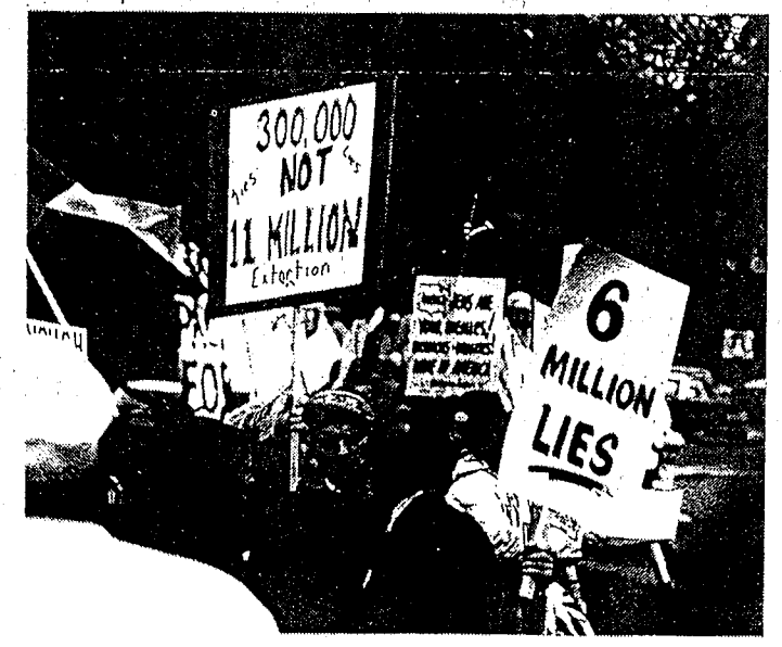
Old and young, male and female, from many ethnic groups joined in to protest the "Museum of Hate and lies,