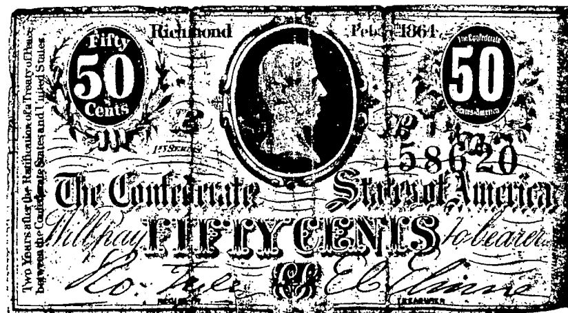
The Confederate war effort was essentially financed by fiat money. This fifty-cent note was dated 17 February 1864. Note the inscription: "Two Years after the Ratification of a Treaty of Peace between the Confederate States and the United States The Confederate States of America will pay FIFTY CENTS to bearer." The portrait is that of Jefferson Davis.