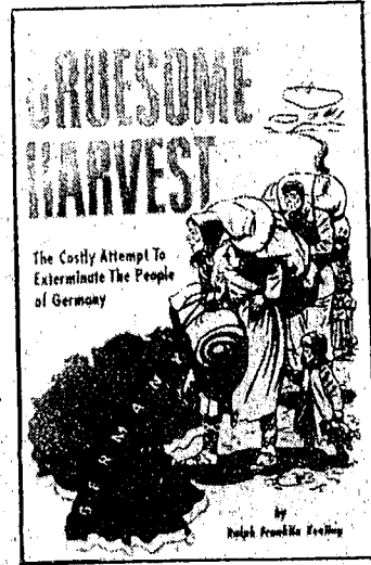
ORDER No.: 7012 - $4.00

The loud-mouthed champions of the perverts in Chicago should have been more wary, for their own good, but for the good of the remaining Aryans in this multi-racial country, it is perhaps well that they were not.