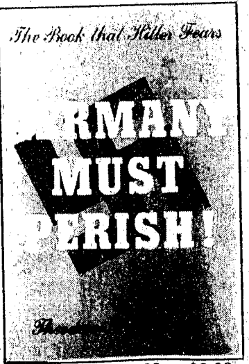
ORDER No.: 7009 - $3.00

For postage and handling, please include $1. for orders under $10., 10% for orders over $10.