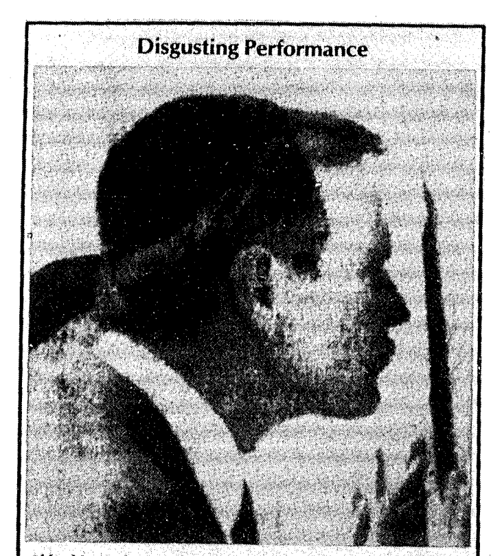
If he kisses the Wailing Wall today, what will George Bush kiss when he runs for President?

argue the point. There can be no second opinion. It is not permitted. And we even have the Jerry Falwell type of thought police to back up the U.S. government in this exclusive viewpoint of current events and recent history.