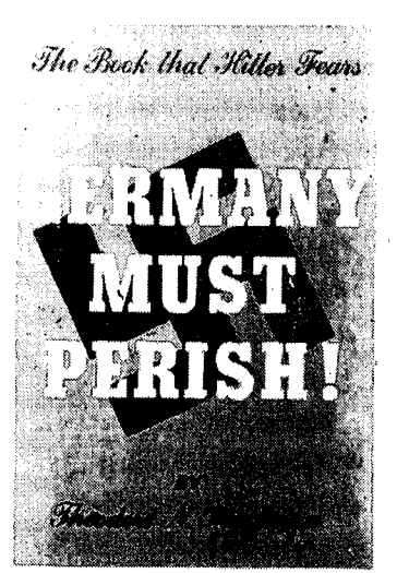
ORDER No.: 7012 - $4.00