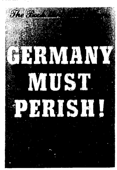
ORDER No.: 7012 — $4.00