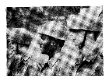
A new "Austrian" performs his military service.

Austria. Since 30 UN resolutions were critical or denunciatory of Israel in 1992, the World Jewish Congress at a meeting in Vienna has decided to establish a UN Watch.