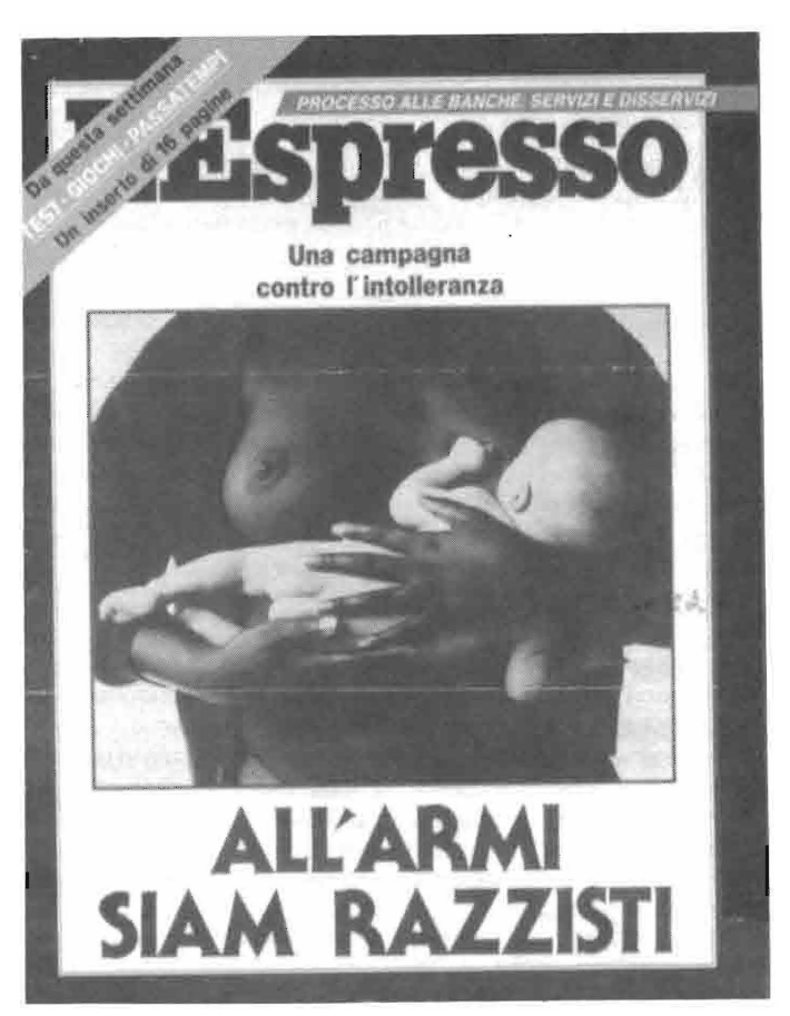
Italians are getting fed up with this kind of integrationist propaganda.

Up to now, mainly Catholic peoples like the Irish and Italians have accused the Germanic, especially the Anglo-Saxon, peoples of being responsible for racism. In Ireland, outside Dublin at least, some still hold to this view. Because they have so few aliens among them, the moment of truth has arrived for Italians.