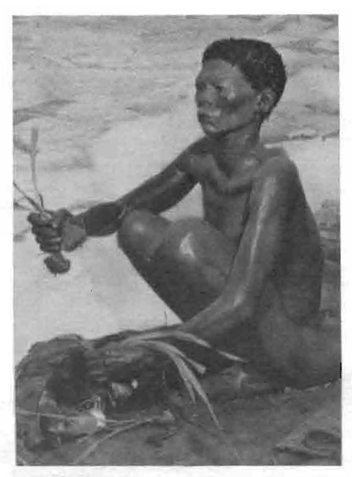
Bushwoman preparing dinner of roots

The Bushmen's skin is more yellow than anything else, quite unlike Negro skin. Their hair is not kinky like that of Negroes, and their noses not so flat and flaring. They look more Chinese than Negro and were altogether a mysterious people, much more peculiar than Australian Aborigines. Their language is a mere succession of clicks. They can count up to three, which is one more than a baboon can count. As it happens, the hair of the Bushman in the picture is not entirely typical in that it is generally more "peppercorn," that is, bare skull interspersed with tufts of hair.