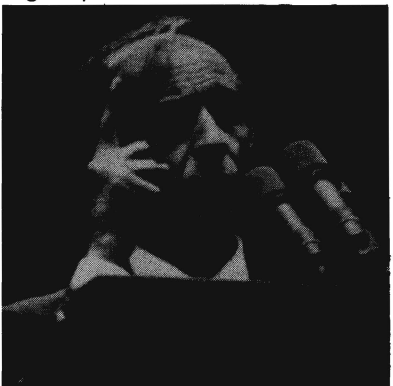
Wiesel -- hate advocate

The pièce de résistance was the banquet address on the first night by Nobel Peace Prize winner Elie Wiesel. Introducing the