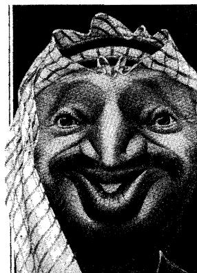
Israelis are applauding a new Dutch postcard that is not very kind to Yasser Arafat.

It's not only in the occupied territories that Palestinians are dying. Three of them were burned to death in Or Yehud, a town in Israel proper, in early September when someone (guess who?) bolted the door of the shack in which they were sleeping and set it on fire. In Tel Aviv no one cared. The café set was laughing at a new joke -- that the intifada was a new Mexican dish.