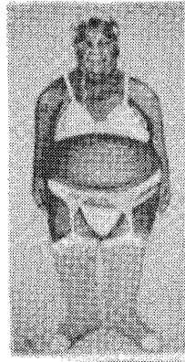
In skimpy drag