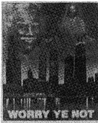
Washington compared to Christ