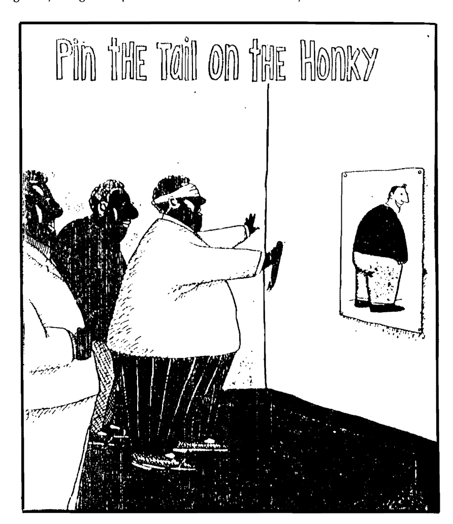
The anti-whitism of the Negro who created this cartoon is less than subtle. It is available from TomRe Enterprises, Pittsburgh, PA.

Chagnon is one more example of the distressing situation in which the discoverer of truth is compelled to expound on it untruthfully.