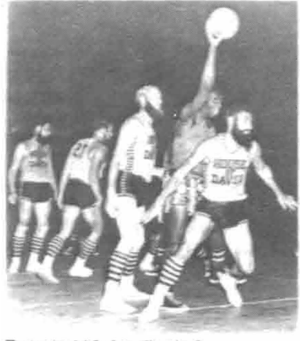
Tenants 110, Landlords 0.

spends six hours per day "thinking about guys," two hours "sipping diet drinks," and 1\frac{1}{2} hours "giving Iranian students the brush-off."