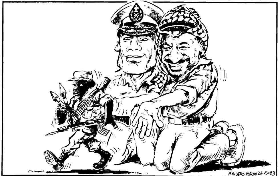
Black terrorism -- the official South African view.

The ANC is merely the lackey of the Kremlin.