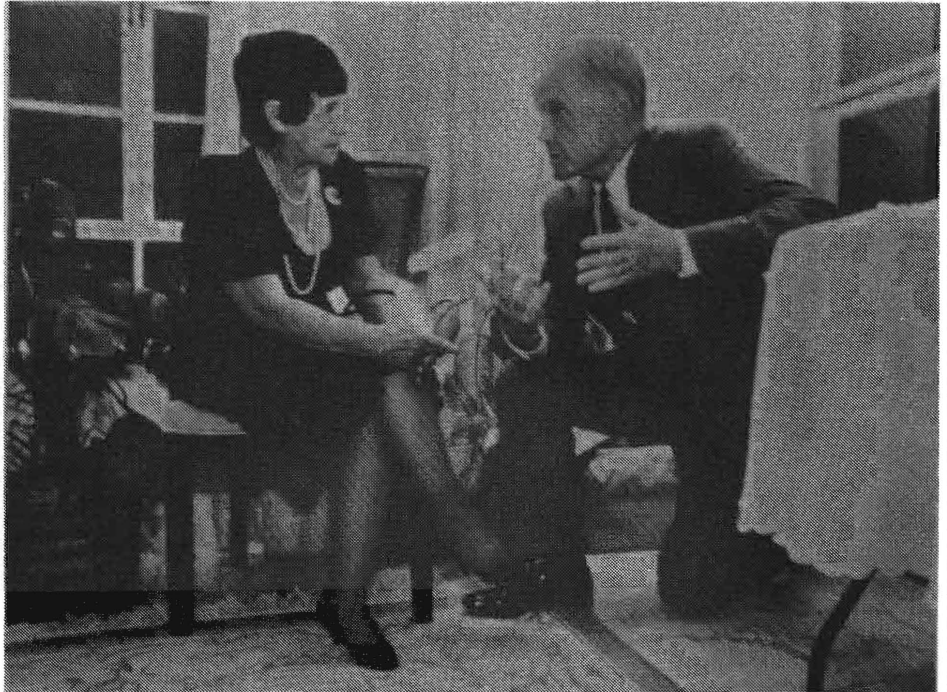
This disgusting piece of camera work appeared in Newsweek (July 18, 1983). A leading presidential candidate, a latter-day Lindbergh, the first American to orbit the earth, the quintessential possessor of the "right stuff," assumes the most servile of all postures to beg for money from a Miami Jewess. illic heu miseri traducimur!