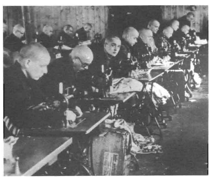
The tailor shop at Sachsenhausen

No one denies that the camps were horrible places -- both for the inmates and for the staff. Toward the end of the war, conditions in the camps deteriorated very rapidly due to Allied bombing of the rail and road distribution networks. Germany was deliberately starved into submission by Allied bombing and blockades. Many thousands of Germans also starved to