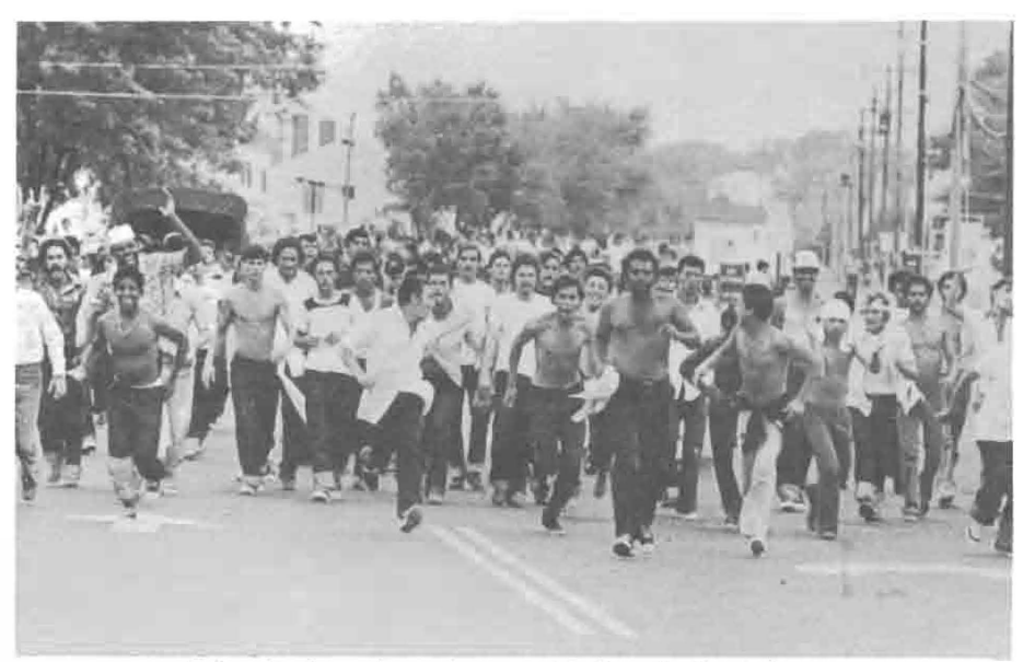
Cuban "refugees" running amuck in Fort Chaffee, Arkansas.