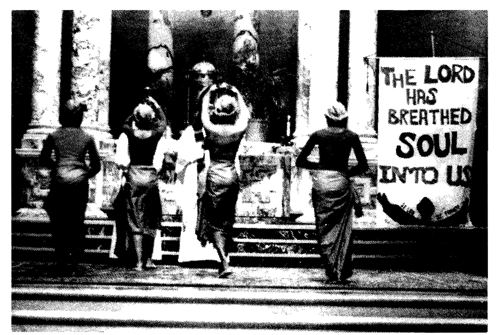
Praise the Lord

when a preacher-cum-aeronaut and his fifty followers failed to float heavenward like balloons, as he had so flatly predicted. Since some of those bound for glory had sold homes, businesses and cars in preparation for their flight departure, a little fast-talking was definitely in order on someone's part. Not missing a beat, the hot-air Christer said he "may" have had the date wrong, "but we know it's going to happen shortly."