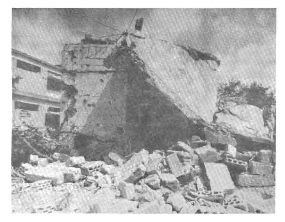
Village of Damour after an Israeli air attack

While the silence from Washington remains deafening, even British liberals are finally speaking out. Christopher Bourne writes in the New Statesman (Aug. 3, 1979):