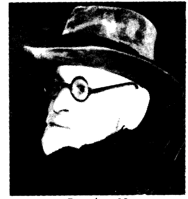
Freud at 82

Upper middle class, 97% white, 65% female, 45.2% Jewish, 43.6% Protestant, 10.1% Catholic.